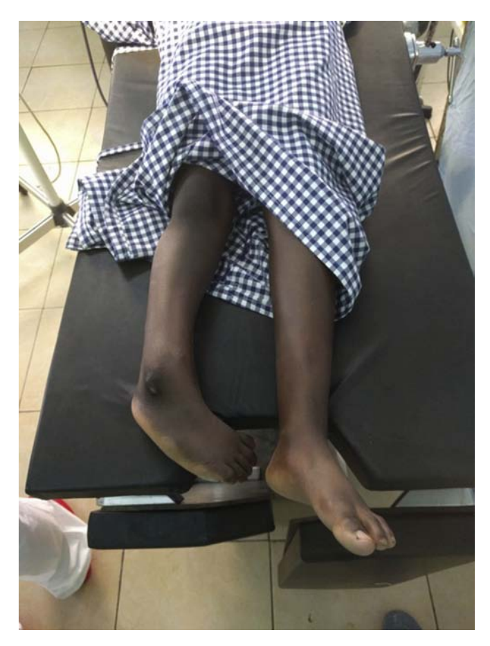
Fig. 1. Pre-operative clinical picture of right affected leg.