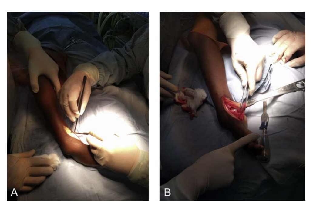
Fig. 3. Medial approach to the right ankle (A). This approach was used to isolate and resect the ex-ceeding distal tibial (B).