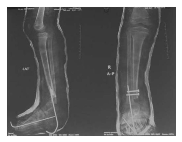
Fig. 7. Post-operative X-ray evaluation, latero-lateral (A) and antero-posterior view (B).

Due to the rarity of the type of TH descripted, such case reports are very infrequent in the literature. Several classification systems