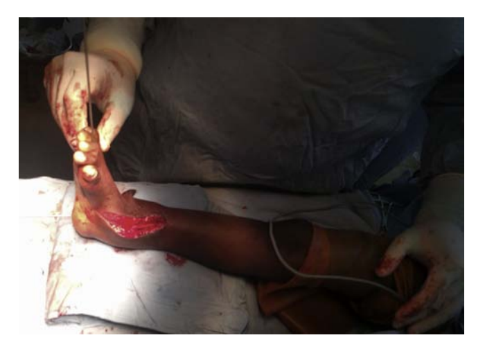
Fig. 6. Intra-operative picture of the correction of the foot. We stabilize ankle in proper position with two percutaneous K-wire.